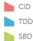
Local Taxing Districts